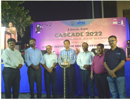
Director, Assistant Director, Superior, Dean Academics and Heads of Programmes during the inaugural ceremony of CASCADE 2022.

and ROTARACT were given certificates for their contribution in all the extra-curricular events organized throughout the year in the Institute.