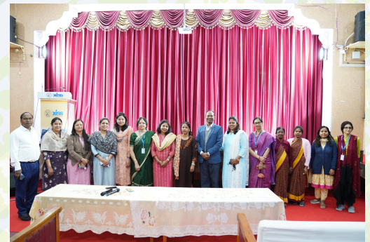
Assistant Director and Finance Officer along with Faculty and Staff during the International Women's Day celebration