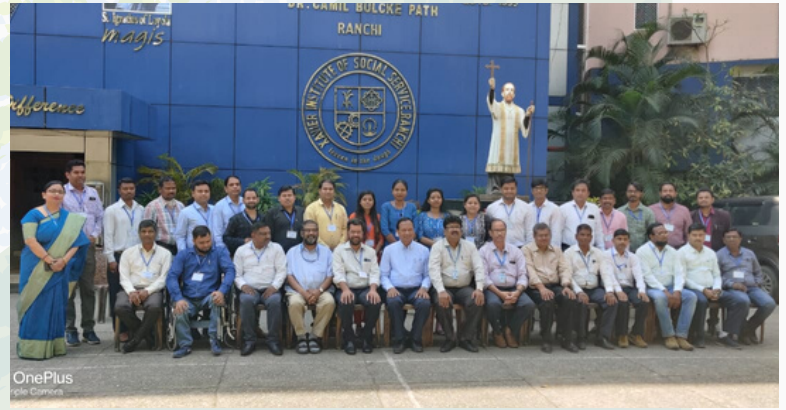
Director XISS along with Faculty of Rural Management Programme and trainees from JSLPS during the Management Development Programme.

Leaders of the development sectors face a lot of challenges while leading a team for the organizational growth. The challenges are flanked up while influencing the team, resolving the internal conflict, providing right training to the team members, accomplishing the organizational growth and development, building the morale of the team members and motivate. In view of the above challenges, field level various difficulties and organizational goals of JSLPS, the Programme of Rural Management (RM) of XISS, Ranchi has instituted an agreement with the Jharkhand State Livelihood Promotion Society (JSLPS) to sensitize their district and block level officials through Management Development Programme (MDP) training. JSLPS agreed upon conducting two training MDPs on Effective Leadership and Team Management, for the District Level managers of JSLPS.