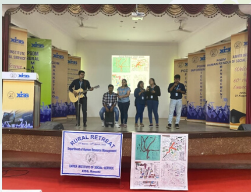
Students of HRM Programme performing during the Valedictory Programme of Rural Retreat Camp.