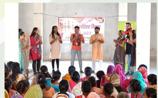
Students of Rural Management Programme during the International Women's Day celebration in Sarwal Village