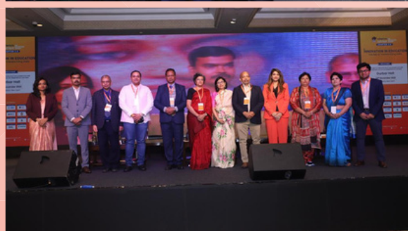
XISS Director awarded Outstanding Leadership Award

Director, XISS, Ranchi, was awarded the Outstanding Leadership in the Individual Category Awards in the Collegedunia Connect 3.0 summit at the Hotel Taj Palace in New Delhi in November. The event organised on the theme, "Innovation in Education: A Key to Transforming India," was a dynamic platform for several insightful discussions on the measures to be taken for shaping the future of education.