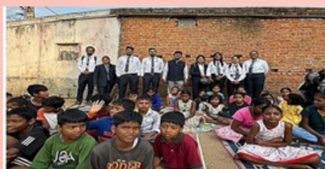
Students celebrate Children's Day in Urban Slums

On 14 November 2023, Children's Day was celebrated in all eight slum areas during Urban Field Exposure by the first-year students of the Rural Management Programme under