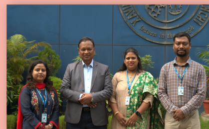
XISS Bulletin Team