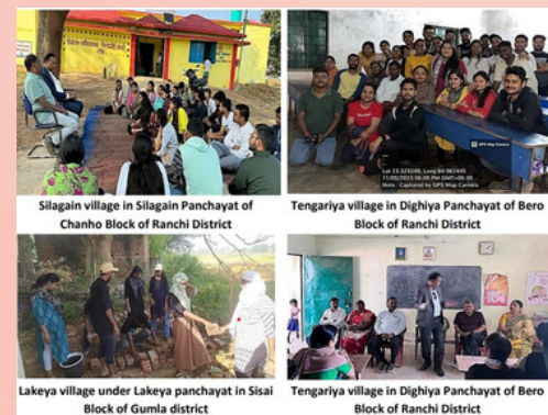
Students attend Rural Field Exposure