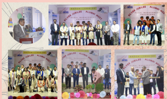
Silver Jubilee Reunion of PGDM-RD, batch of 1996-98

XISS, Ranchi, commemorated the Silver Jubilee Reunion of its PGDM-Rural Development, class of 1996-1998 to enjoy campus life and revive their beautiful memories in the campus on 24 November 2023. 21 alumni from the batch attended the event at their alma mater. The alumni of this batch are well placed in several developmental, corporate, academic, and social service organisations across the nation and abroad.