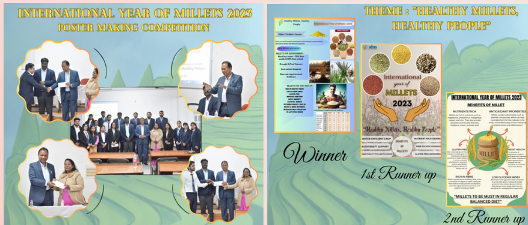
Online Digital Poster Making Competition

https://xiss.ac.in/news/online-digital-poster-making-competition-on-occasion-of-international-year-of-millets