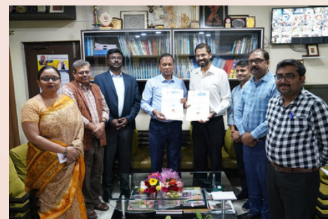
MoU signed between XISS and SwitchON Foundation