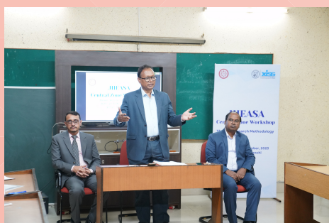
Workshop on Research Methodology for JHEASA

XISS, Ranchi, on the request of Jesuit Higher Education Association South Asia (JHEASA), organized a three-day workshop on research methodology at its campus from November 28 to 30, 2023. The event saw enthusiastic participation from 18 faculty members hailing from renowned Jesuit higher educational institutes such as St. Xavier's College, Ranchi, St. Xavier's College, Simdega, St. Xavier's College Dumka, St. Xavier's College Ambikapur, Loyola College, Kunkuri and XIDAS, Jabalpur among others.