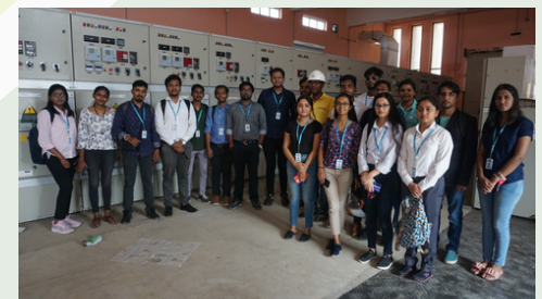
XISS students during the One-day awareness programme organised on Ranchi Smart City Mission.