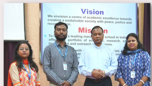
XISS Bulletin Team