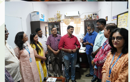
Hand-over of HoPs responsibilities across four programmes in presence of Dean Academics.