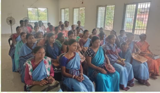
Orientation of frontline workers in Dumka under Covid Teeka Maha Abhiyan.

To expedite the vaccination coverage to the eligible population, the Government of India has launched the second phase of Covid Teeka Maha Abhiyan and Har Ghar Dastak. The campaign started on 1 June and will continue till 31 July 2022. During this, the government aims to reach maximum vaccination coverage. In the districts of Jharkhand also, the campaign was taken as a priority and health departments have focused on vaccinating the population. The XISS-UNICEF supported DPCs are involved in the orientation of the frontline workers, IEC campaigning and preparation of micro plans. It is expected that the campaign will push the vaccination speed in the state.