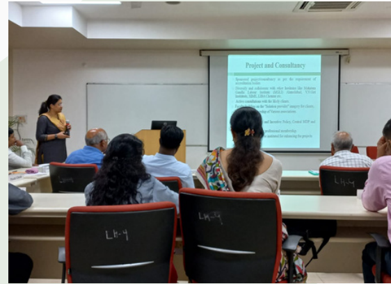
XISS Faculty during the Institutional-cum-Faculty Development Programme.