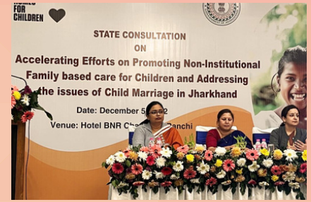
State Consultation on Accelerating Efforts on Promoting Non-Institutional Family-based Care for Children and Addressing the Issues of Child Marriage in Jharkhand