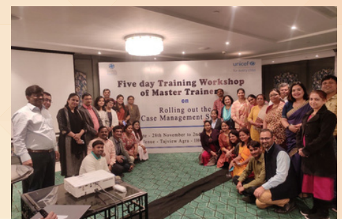
Super Master Trainers Training in Case Management UNICEF