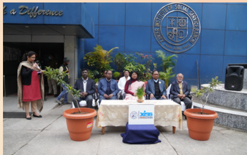
MP Dr Mahua Maji laid the foundation of beautification work at XISS

https://www.xiss.ac.in/news/mp-dr-mahua-maji-laid-the-foundation-of-beautification-work-at-xiss