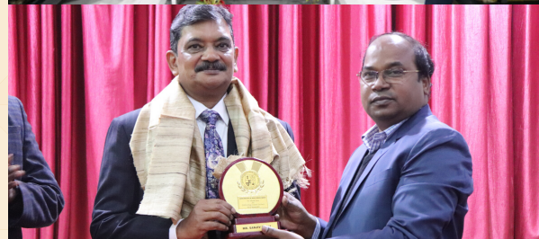
Guest lecture on Financial Inclusion and Monetary Policy by GM, RBI, at XISS