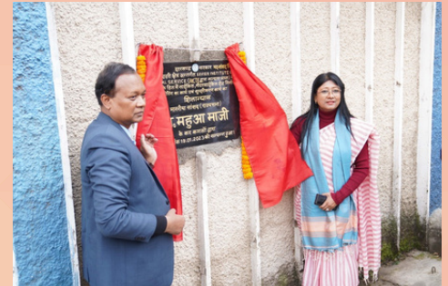
MP Dr Mahua Maji laid the foundation of beautification work at XISS