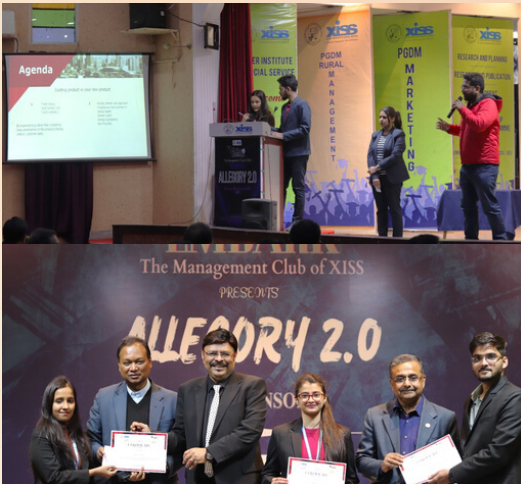
Allegory 2.0- The Brand Repositioning Competition held at XISS