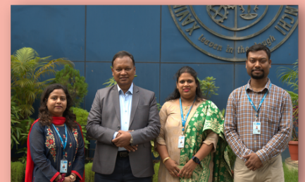
XISS Bulletin Team